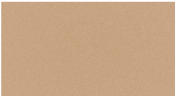
CLASS I LIGHT BRONZE

Fleetwood offers two custom anodized colors: