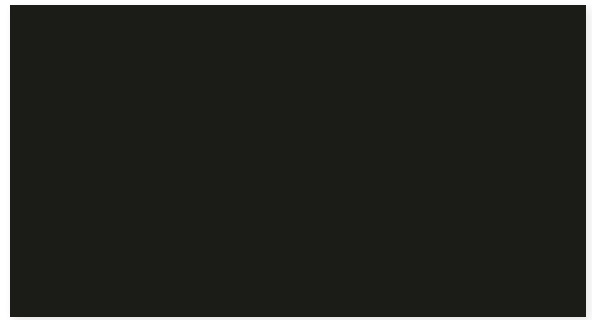
CLASS I DARK BRONZE